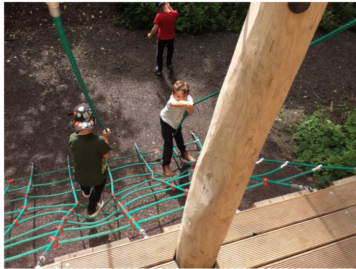
Everyone enjoyed the trip to the Big Spinney this term – the pictures say everything about how much the children got out of the experience.